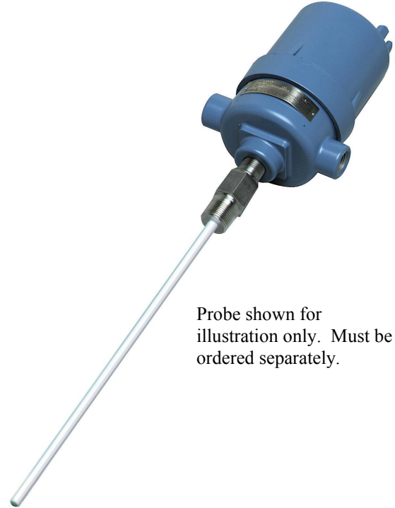
Probe shown for illustration only. Must be ordered separately.

the individual set-point adjustment potentiometers. When the probe charging rate is equal to either of the fixed reference capacitor charging rates, integrated circuit amplifiers cause the appropriate control relay to de-energize.